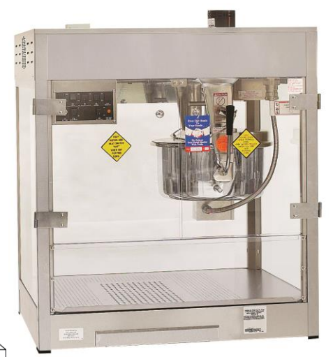
Operator Side View